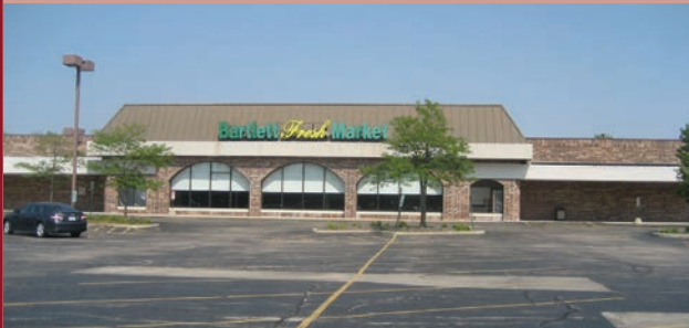
& Streets of Bartlett, today